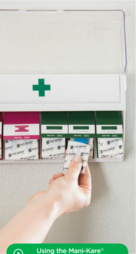
Using the Mani-Kare® Bandage Dispenser

First aid products are a major requirement for the foodservice industry and our first aid systems are tailored to meet these specific regulations. With SmartTab technology notifying you when you need to restock your kits, our FirstAid solutions help keep your kits compliant to industry safety standards.